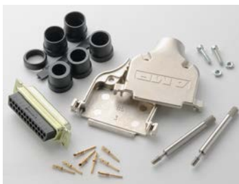
Figure 1: Model 7709-308A connector

The Model 7709-308 is a 25-pin D-shell male connector with solder cups. It can be used with Model 7701, 7707, 7709, and Series 2600A SourceMeters.