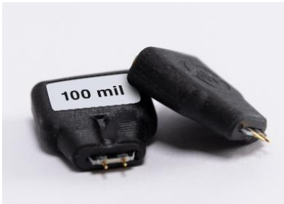
P2103A probe heads